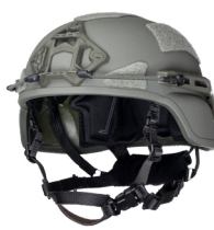
REGULAR-CUT W/ AIRELINK PLUS & AIRESUPPORT PRIME