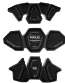
AIRESUPPORT PRIME ADVANCED SUSPENSION SYSTEM BLACK, GREEN