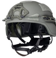
REGULAR-CUT W/ AIRELINK PLUS & AIRESUPPORT PRIME