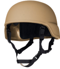
REGULAR-CUT W/ AIRELINK & AIRESUPPORT