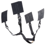
AIRELINK STANDARD RETENTION SYSTEM BLACK, FOLIAGE GREEN, TAN, OLIVE GREEN, COYOTE BROWN