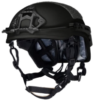
HIGH-CUT W/ AIRELOCK SYSTEM