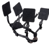
AIRELINK PLUS DIAL RETENTION SYSTEM BLACK, FOLIAGE GREEN, TAN, OLIVE GREEN, COYOTE BROWN