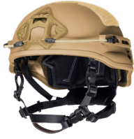
MID-CUT W/ AIRELINK PLUS & AIRESUPPORT PRIME