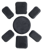
AIRESUPPORT STANDARD SUSPENSION SYSTEM BLACK, GREEN